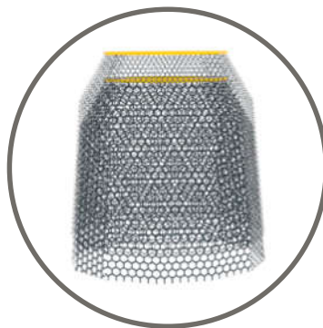
Stackable screening baskets with different mesh sizes: 20/30/40/50/60 and 80 mm