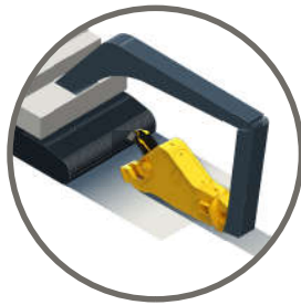
Stick-mounted 3rd member