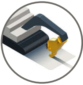
Boom-mounted 2nd member

By forcing the material to where the cutter exerts the greatest force, the optimally-shaped jaw cuts through steel easily, no matter the size.