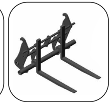
Forks Mounted on Quick Coupler